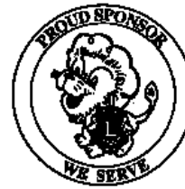
Proud Sponsor Lapel Pin