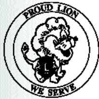
Proud Lion Lapel Pin

When your club Secretary receives the completed Achievement Form (page 9), he or she should send a copy of the Achievement Form to the Membership Operations Department at Lions Clubs International so you may receive your Proud Lion/Proud Sponsor lapel pins. In addition, Proud Lion/Proud Sponsor vest pins are available for purchase when earned. The Secretary will also notify the appropriate parties to arrange for club recognition and a celebration of your continued success. Take this opportunity to share your experiences with the Lions Mentoring Program and to acknowledge your continued growth as a Lion. As an accomplished LEVEL TWO Protégé, you are now qualified to advance to the next level of the Lions Mentoring Program, LEVEL THREE: RESULTS.