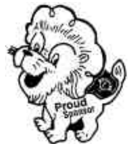
Proud Sponsor Vest Pin

A single vest pin is available for the Proud Lion. Because a Proud Sponsor might become involved with more than one Protege Lion there are eight (8) Proud Sponsor vest pins available following this sequence of member sponsorship: