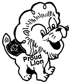
Proud Lion Vest Pin